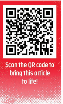
Scan the QR code to bring this article to life!